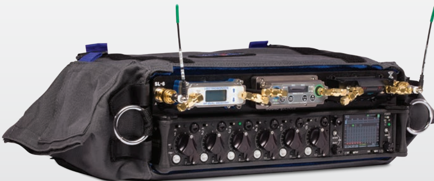
SL-6 with Slot-In Receivers Connected to a 688 (in a CS-664 bag)